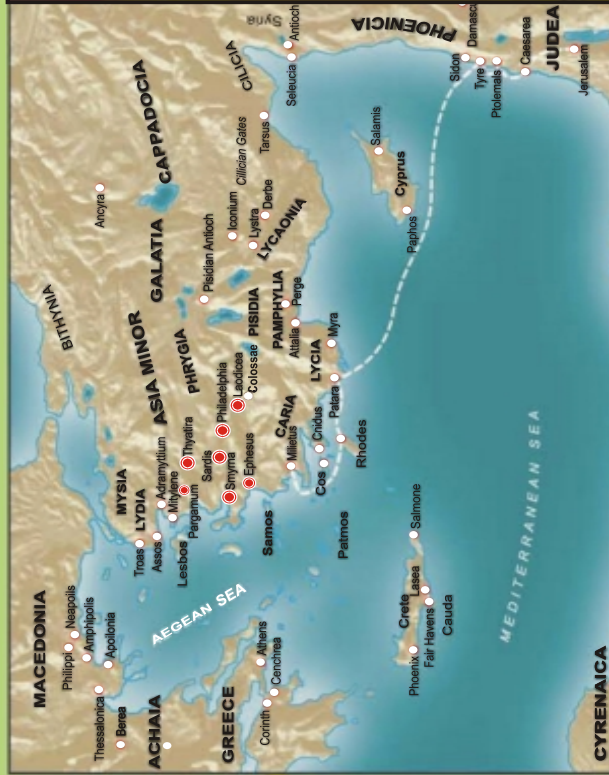
ASIA MINOR (TURKEY)